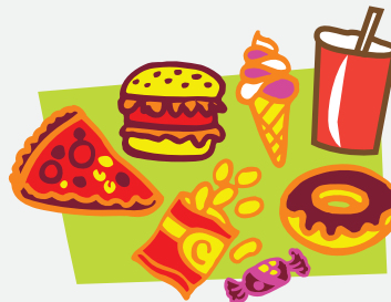
Sweets, food, drinks, sugars