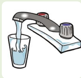
Drink tap water