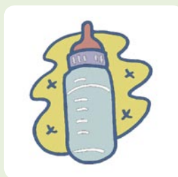
Wean off bottle (At least no bottle for sleeping)