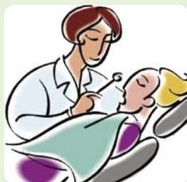
Family receives dental treatment