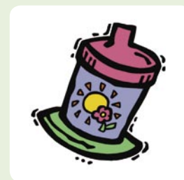
Only water or milk in sippy cup