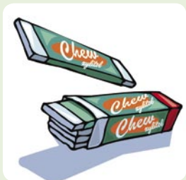
Chew gum with xylitol