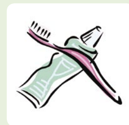
Brush with fluoride toothpaste at least twice daily