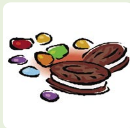
Less or no candy and junk food

IMPORTANT: The last thing that touches your child's teeth before bedtime is the toothbrush with fluoride toothpaste.