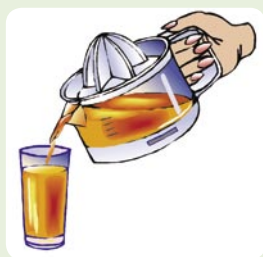
Less or no juice