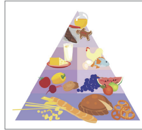
Cov khoom noj ua si zoo