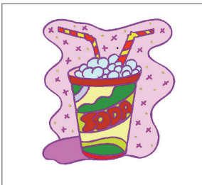
Tsis haus dej soda