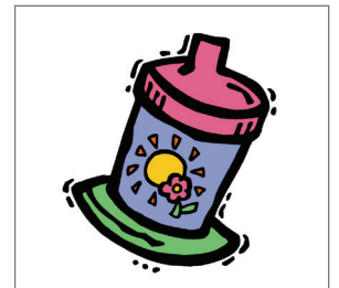
Tsuas tso cov dej lossis cov mis rau hauv lub khob