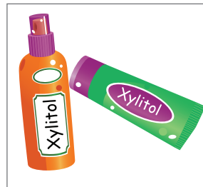
Siv tshuaj cawv, tshuaj nplaum lossis tshuaj yaj

TSEEM CEEB: Yam raug koj tus menyuam cov hniav ua ntej lub sijhawm pw yog tus pas txhuam hniav nrog rau cov tshuaj txhuam hniav.