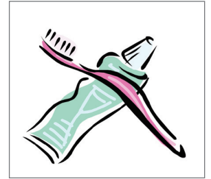
Ib hnub twg yuav tsum siv tshuaj txhuam hniav 2 zaug