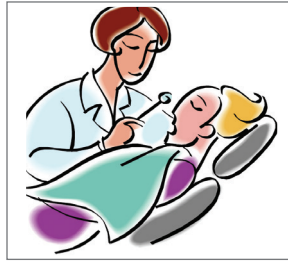
Family receives dental treatment