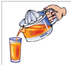
Less or no juice