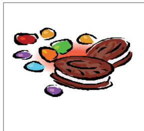
Less or no junk food and candy