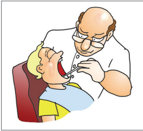
Regular dental visits for child