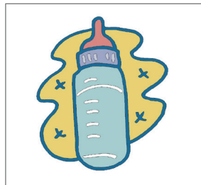
Wean off bottle (no bottles for sleeping)