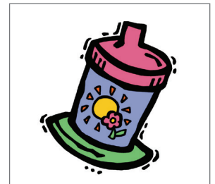
Only water or milk in sippy cups