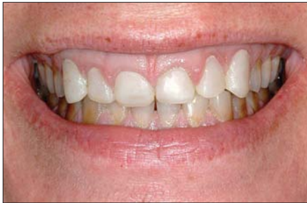
Figure 5a. Patient presents with an asymmetric free gingival margin position, excessive gingival display, failing restorations, and tetracycline staining.