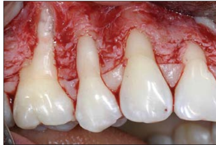
Figure 1b. Split-thickness recipient site preparation with primary flap elevated to create pouch for graft. The roots have been instrumented.