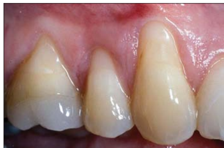
Figure 2a. Patient presents with moderately advanced recession and a lack of attached gingival.