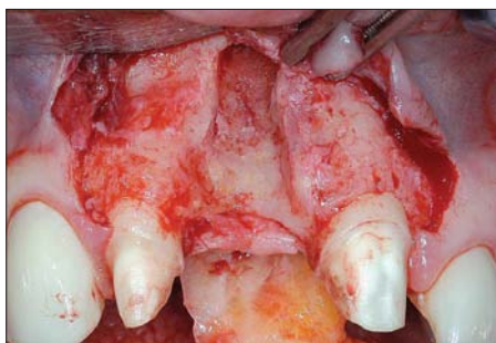
Figure 4b. After removal of the implant, there is substantial loss of the buccal plate. The mesial, distal, and palatal walls of the extraction socket are relatively intact.