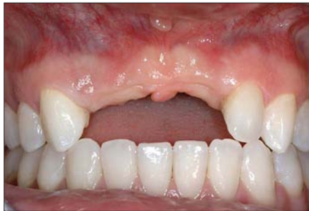
Figure 3a. Patient presents with moderate Class III ridge defect and a failing tooth No. 10 that will need to be removed. Implants are planned for the No. 7 and 10 sites.