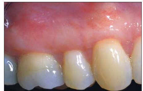
Figure 2b. Two months following a connective tissue graft. There is complete root coverage as well as an increase in the thickness and vertical dimension of the attached gingiva. The grafted tissues blend well with the native tissue.

gingival margin in an apical and lingual direction. 9,10