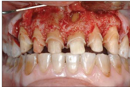
Figure 5b. Flap elevated to show the position of the osseous crest. Bone will need to be removed circumferentially around each tooth to establish adequate room for the dentogingival complex apical to the desired position of the crown margins. Note the apical loss of the buccal plate due to an endodontic lesion on tooth No. 9.