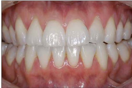
Figure 1a. Patient presents with generalized slight to moderate recession, gingival asymmetry, thin alveolar housing, and lack of attached gingival.