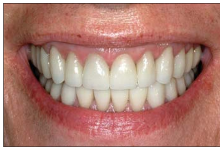
Figure 5d. Post-treatment smile exhibiting gingival symmetry, reduced gingival display, and improved dental esthetics (Restorative dentistry by Drs. Julie Djie and Dan Gustavson).

to a location on the tooth that is esthetically and structurally more favorable while maintaining the health of the tissues.