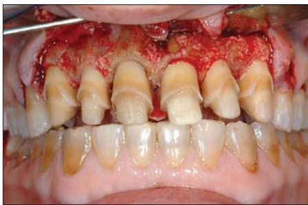
Figure 5c. Osseous surgery has been done to remove enough bone to re-establish the position of the dentogingival complex relative to the projected restorative margins. The lesion on No. 9 was treated with endodontic therapy.