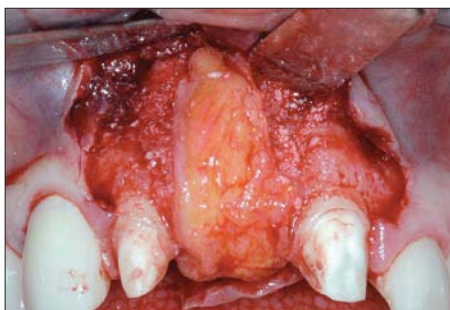
Figure 4c. A slowly resorbable bone graft material has been placed in the socket and covered by a connective tissue graft.