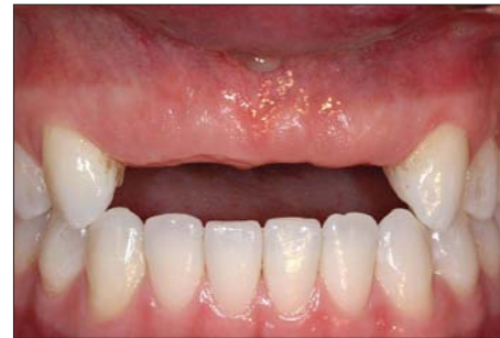
Figure 3c. Six-month postop. At this time, the ridge was assessed as adequate and the patient was referred to the restorative dentist to begin therapy.