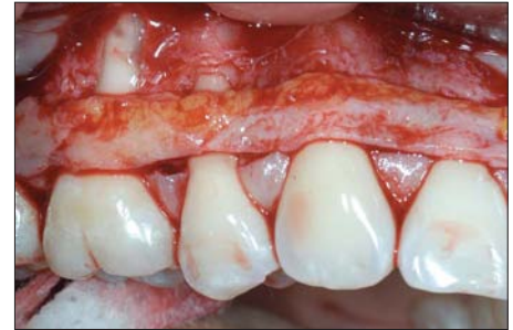
Figure 1c. Prior to closure of the primary flap a connective tissue graft is placed over the roots.

(Figures 1b, c). This pouch provides a dual blood supply to the graft from the superior and inferior connective tissue surfaces in contact with the graft. The retained superior flap also maintains the esthetics of the original tissues and acts as a source for the epithelial cells that migrate over the exposed portion of the connective tissue graft (Figures 1d, e). These grafts are very successful in covering the root and blending with the adjacent tissues for a highly esthetic result (Figures 2a, b).