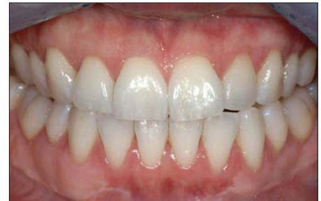
Figure 1e. Seven months' postop. The maxillary recession has been corrected, gingival symmetry has been restored, the gingiva is thicker, and there is an increase in the amount of attached gingiva. The mandibular teeth were simultaneously treated with free gingival grafts.