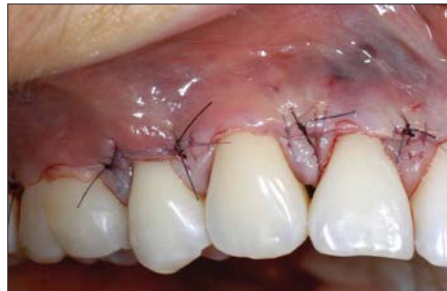
Figure 1d. Primary flap sutured closed over the connective tissue graft with 7-0 sutures.

Removal of a tooth or implant results in collapse of the alveolus and causes a shift of what had been the free