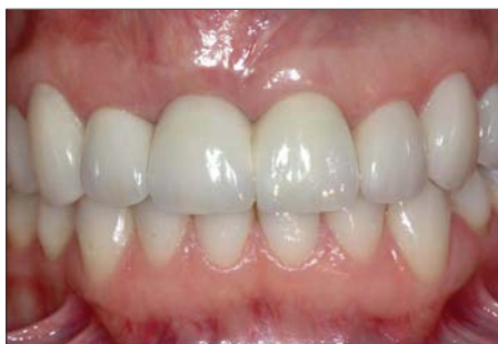
Figure 4d. A fixed partial denture with an ovate pontic at the No. 8 site was utilized to replace the failed implant (Restorative dentistry by Dr. Belinda Gregory-Head).

of connective tissue to restore the missing tissue volume. In some cases, multiple, sequential, ridge augmentations will be required to fill the defect. The final prosthesis can be undertaken four or more months after the last surgical procedure. 1